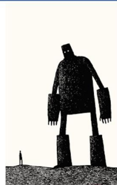
Tom Gauld 2005