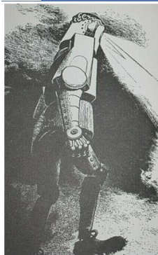
George Adamson 1968

We be responding to and comparing works of art by different artists.