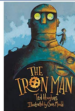
Chris Mould 2019

We will use charcoal and pastels to create an Iron Man drawing